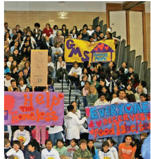
2007 Gunston School Help The Homeless Mini-walk and assembly.